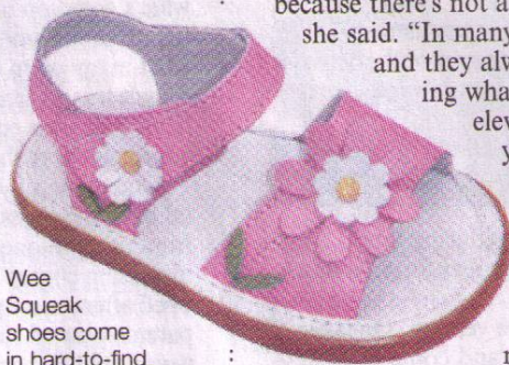
Wee Squeak shoes come in hard-to-find colors and feature a "squeaker" that helps parents track a child as she moves through the house or around the yard.

For more information visit www.weesqueak.net .