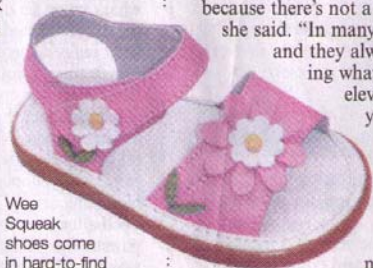
Wee Squeak shoes come in hard-to-find colors and feature a "squeaker" that helps parents track a child as she moves through the house or around the yard.

For more information visit www.weesqueak.net .